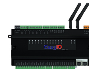
FW28 WiFi IP Controller