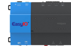
EI-J-8000 Controller (JACE)

With EasyIO you are making the decision to use the industry leading BEMS solution in terms of power, flexibility, opportunity to integrate and cost per performance. Make sure you invest in the best technology that gives you optimal return on your investment, with an ability to support the growing demands of the building stock.