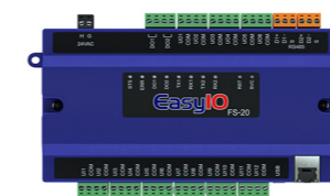
FS 20 Server Class Controller