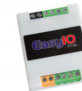
FT WiFi Controller