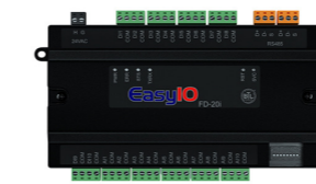
FD Expander Module