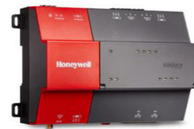
WEB-8000 Controller (JACE)

Add the power of CIPer, Spyder® or Stryker controllers, and you'll have the versatility to choose from a collection of best-in-class control products ready to evolve and meet all of your HVAC, lighting and security needs. Honeywell's scalable solutions are designed to meet current and future demand.