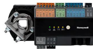
Spyder 5 Controllers